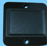
uMetal01 - Metal Mount Tags