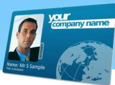
uID - ID Cards