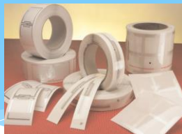
uLabels - Labels/Inlays